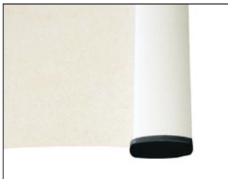
^ ACCOMMODATING A RANGE OF STANDARD PRINT SIZES BANNER PROFILE CAN ALSO BE SUPPLIED TO SUIT CUSTOM SIZE REQUIREMENTS OF UP TO 3000MML