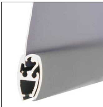
^ OUR INNOVATIVE BANNER PROFILE INCORPORATES A FIXING CLAMP TO SECURELY HOLD IMAGES IN POSITION